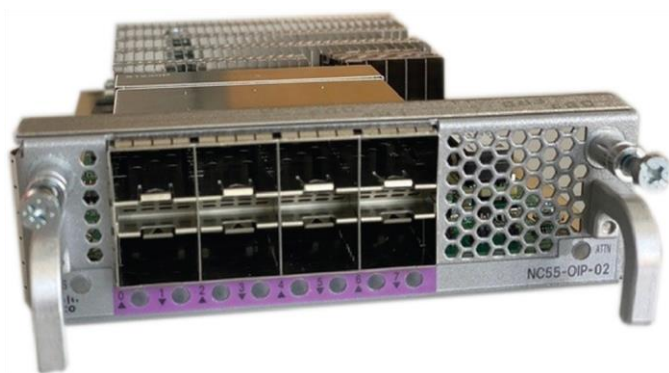
Figure 2. The NC55-OIP-02-FC Modular Port Adaptor