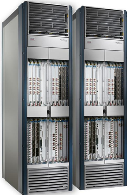
Figure 1. Cisco CRS 16-Slot Back-to-Back (2+0) System

The system does not require topology changes, providing a smooth, uninterrupted path for expanding to a full-scale multichassis system. The 2+0 back-to-back system can be transparently migrated to a full-scale multichassis system while in service by adding a Cisco CRS FCC and up to eight additional CRS LCCs.