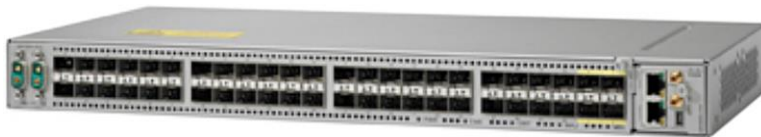
Figure 1. Cisco ASR 9000v

Deployed adjacent to, or remotely from, its Cisco ASR 9000 Series host, the environmentally hardened, front-access, low-power, ultra-compact Cisco ASR 9000v and ASR 9000v-V2 delivers ASR 9000 Series services and scale at locations that are otherwise unachievable by either an access system or an edge system. Because the nV technology extends the Cisco ASR 9000 Series control plane and management interface over a fabric port that incorporates the Cisco ASR 9000v and Cisco ASR 9000v-V2 as a component of the Cisco ASR 9000 Series host, installation, turn-up, Element Management System (EMS) and Network Management System (NMS) integration, and service activation can be accomplished in a matter of minutes (Figure 1).