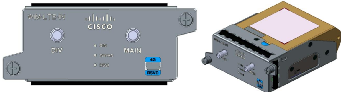
Figure 1. Cisco 4G LTE WIM for the 800M ISR

The Cisco 4G LTE WIM (Figure 1) provides an enterprise-class 4G multimode LTE WWAN solution. With the Cisco 800M ISR, 4G LTE is a powerful primary WAN access solution. Businesses can now run applications such as interactive video and telepresence on a primary 4G LTE connection, which is up to 50 times faster with far lower latency than 3G links. These 4G modules support the latest Third-Generation Partnership Project (3GPP) Release 8 Category 4 LTE standards. The Cisco 4G multimode LTE WIM provides persistent, reliable LTE connectivity with fallback and transparent handoff to earlier technologies. The card provides bandwidth to support high-definition (HD) and peer-to-peer (P2P) video calls, providing customers with an excellent mobile broadband experience. The 4G LTE WIM is tightly integrated with the services provided on the Cisco 800M ISR, which delivers secure data, video, and mobility services. The WIM is supported on the Cisco 800M ISR only.