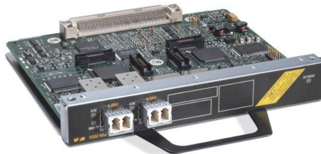
Figure 1 Cisco 2-Port OC-3/STM-1 POS Port Adapter