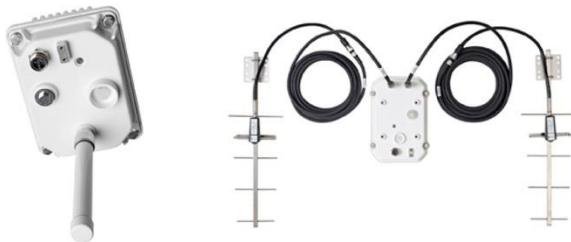
Figure 1. Cisco IR529 base (single omni antenna) range extender and IR529 advanced (dual antenna) range extender

Figure 1 displays the Cisco IR529 Base Range Extender (IR529WP-915S/K9) and the Cisco IR529 Advanced Range Extender (IR529UBWP-915D/K9).