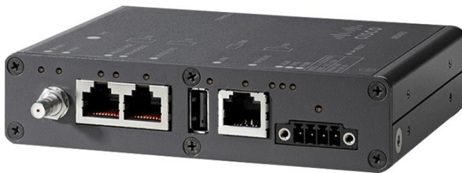
Figure 1. IR500

Figure 1 displays a Cisco WPAN Industrial Router.