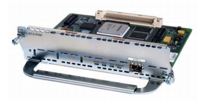
Figure 1. Cisco 3800 and 3900 Series ATM OC-3 Network Module

Cisco IOS SP Services feature sets are required to support ATM. A maximum of one ATM OC-3 network module is recommended on the Cisco 3825 and Cisco 3925, and a maximum of two ATM OC-3 network modules are recommended on the Cisco 3845 and Cisco 3945