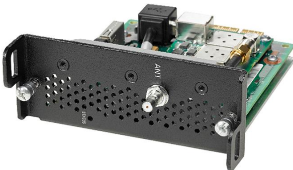
Figure 1. Cisco Connected Grid WPAN Modules

Figure 1 displays the Cisco Connected Grid WPAN modules.