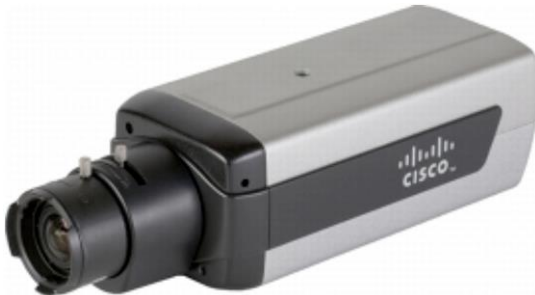
Figure 1. Cisco Video Surveillance 6500PD IP Camera

The Cisco Video Surveillance 6500PD IP Camera offers a variety of benefits, including: