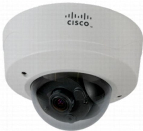
Figure 1. Cisco Video Surveillance 3520 IP Camera

The Cisco Video Surveillance 3520 IP Camera offers a variety of benefits, including: