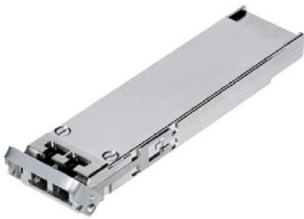
Figure 2. XFP Transceiver module for the Cisco ONS Family

The XFP transceiver module (Figure 2) is a bidirectional device with a transmitter and receiver in the same physical package. The XFP module contains a 30-pin surface mount connector on the electrical interface and a duplex LC connector on the optical interface.