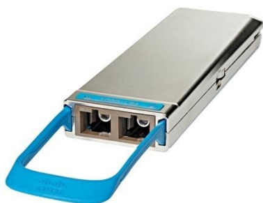
Figure 7. Cisco CPAK module

Cisco CPAK 100GBASE fiber modules offer a selection of high-density 100-Gbps connectivity solutions. By using CMOS photonics technology, Cisco CPAK is smaller and consumes significantly less power than alternative form factors (Figure 7). They are fully interoperable with other IEEE-compliant interfaces.