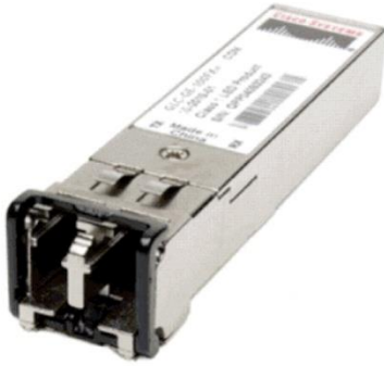
Figure 1. SFP Transceiver modules for the Cisco ONS Family