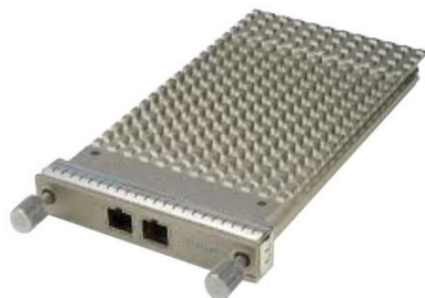
Figure 5. A CFP Transceiver module for the Cisco ONS Family

A CFP transceiver module (Figure 5) is a bidirectional device with a transmitter and receiver in the same physical package. The module interfaces to the network through a connector interface on the electrical ports and through an MPO or LC connector on the optical ports. The electrical connection of a CFP uses 10x10-Gbps lanes in each direction (receive and transmit), while the optical connection can support both 10x10-Gbps and 4x25-Gbps variants of 100-Gbps interconnects (typically referred to as 100GBASE-SR10 and 100GBASE-LR4 in 10 km reach).