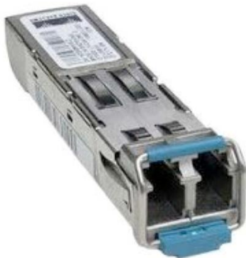
Figure 3. An SFP+ Transceiver module for the Cisco ONS Family

An SFP+ transceiver module (Figure 3) is a bidirectional device with a transmitter and receiver in the same physical package. The module interfaces to the network through a connector interface on the electrical ports and through an LC termination connector on the optical ports. It is identical in size to SFP modules, but capable of 10-Gbps transmission.