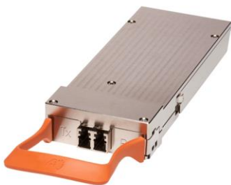
Figure 9. The 400G CFP2-DCO pluggable

Pluggable solutions such as 400G CFP2-DCO are designed to enable network operators to address increasing bandwidth demand through a pay-as-you-grow model that has the potential of reducing both capital and operational expenditures. The 400G CFP2-DCO module incorporates a 7nm CMOS technology, and a silicon photonic integrated circuit (PIC) for an optimized co-packaged design.