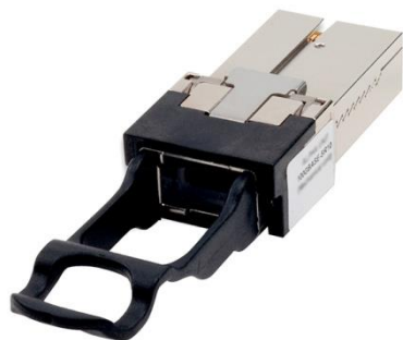
Figure 4. A CXP Transceiver module for the Cisco ONS Family

An CXP transceiver module (Figure 4) is a bidirectional device with a transmitter and receiver in the same physical package. The module interfaces to the network through a connector interface on the electrical ports and through a Multifiber Push On (MPO) termination connector on the optical ports. It is dedicated usually for 100-Gbps transmission, and it is only capable of 100GBASE-SR10 connectivity.