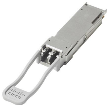
Figure 6. A QSFP+ Transceiver Module for the Cisco ONS Family

The Cisco 40GBASE QSFP portfolio offers customers a wide variety of high-density and low-power 40 Gigabit Ethernet connectivity options for data center, high-performance computing networks, enterprise core and distribution layers, and service provider applications.