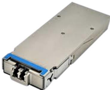
Figure 2. CFP2-ACO Based Trunk Optics