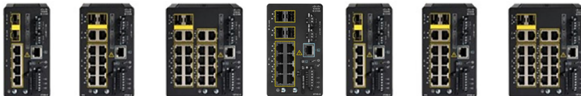
Figure 1. IE-3100 Rugged Series switches models