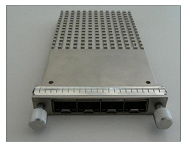
Figure 3. Cisco FourX Converter Module

The Cisco FourX converter module (Figure 3) offers the flexibility to convert a 40 Gigabit Ethernet CFP port of a Cisco switch or router into four independent 10 Gigabit Ethernet ports supporting Cisco 10GBASE Small Form Factor Pluggable Plus (SFP+) modules. The 10 Gigabit Ethernet SFP+ modules are not included.