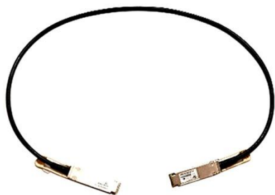
Figure 2. Cisco 40GBASE-CR4 QSFP direct-attach copper cables

Cisco QSFP to QSFP copper direct-attach 40GBASE-CR4 cables (Figure 3) are suitable for very short distances and offer a very cost-effective way to establish a 40-gigabit link between QSFP ports of Cisco switches within racks and across adjacent racks. Cisco currently offers passive cables in lengths of 0.5, 1, 2, 3, 4 and 5 meters and active cables in lengths of 7 and 10 meters.