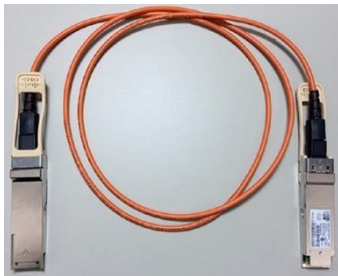
Figure 4. Cisco 40G QSFP active optics cables

Cisco QSFP to QSFP copper direct-attach 40GBASE-CR4 cables (Figure 5) are suitable for very short distances and offer a flexible way to connect within racks and across adjacent racks. Active optical cables are much thinner and lighter than copper cables, which makes cabling easier. Active optical cables enable efficient system airflow and have no EMI issues, which is critical in high-density racks. Cisco currently offers active optical cables in lengths of 1, 2, 3, 5, 7, 10, 15, 20, 25 and 30 meters.