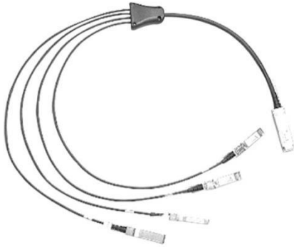
Figure 3. Cisco QSFP to Four SFP+ copper breakout cables

Cisco QSFP to four SFP+ copper direct-attach breakout cables (Figure 2) are suitable for very short distances and offer a very cost-effective way to connect within racks and across adjacent racks. These breakout cables connect to a 40G QSFP port of a Cisco switch on one end and to four 10G SFP+ ports of a Cisco switch on the other end. Cisco currently offers passive cables in lengths of .5, 1, 2, 3, 4 and 5 meters and active cables in lengths of 7 and 10 meters.