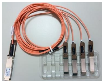
Figure 5. Cisco 40G QSFP to Four SFP+ breakout active optics cables

Cisco QSFP to four SFP+ active optical breakout cables (Figure 4) are suitable for very short distances and offer a flexible way to connect within racks and across adjacent racks. Active optical cables are much thinner and lighter than copper cables, which makes cabling easier. Active optical cables enable efficient system airflow and have no Electro Magnetic Interference (EMI) issues, which is critical in high-density racks. These breakout cables connect to a 40G QSFP port of a Cisco switch on one end and to four 10G SFP+ ports of a Cisco switch on the other end. Cisco currently offers active optical breakout cables in lengths of 1, 2, 3, 5, 7, and 10 meters.