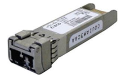
Figure 1. Cisco DWDM SFP+ Module

The Cisco<sup>®</sup> iTemp 10GBASE DWDM SFP+ Modules (Figure 1) are pluggable, temperature-hardened transceiver modules designed to deliver Remote PHY (R-PHY) capability in field or headend environments. They enable plug-and-play configuration of 10-Gbps Ethernet signals for simple configuration of R-PHY devices or shelves. There are 2 types of 10GBASE DWDM SFP+ modules, one tunable module and 3 reaches of fixed wavelength modules have With 40 ITU C-band wavelengths and three different distance values available. The tunable module has 70km reach, and 96 50Ghz ITU C-band wavelengths it can be tuned to. Operators can control cost and wavelength assignments, and match link budgets in their fiber-deep networks. The standards-based SFP+ devices are compatible with existing passive filters and splitters, speeding deployments and minimizing service disruptions.