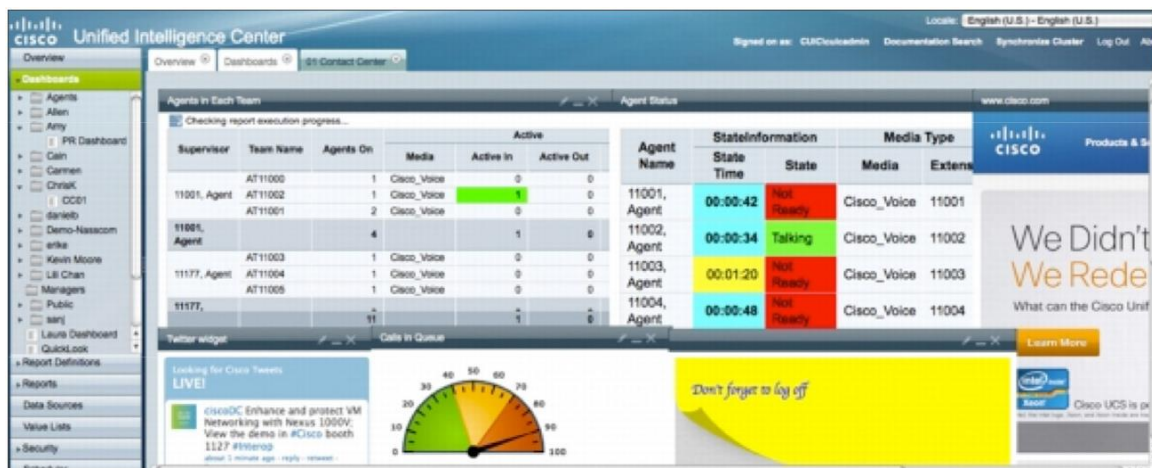
Figure 1. Cisco Unified Intelligence Center Dashboard

This web-based reporting application provides real-time and historical reporting in an easy-to-use, wizard-based application for Cisco Contact Center products. It allows contact center supervisors and business users to report on the details of every contact across all channels in the contact center from a single interface (Figure 1).