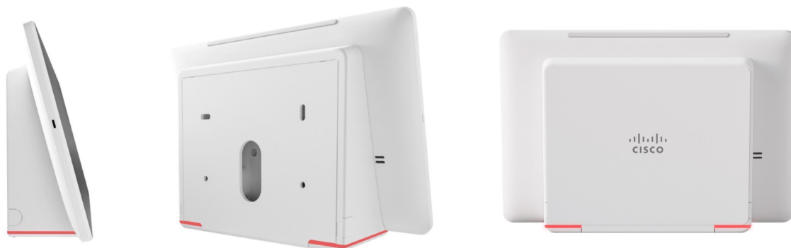
Figure 5: Rear and side views of the wall-mount Room Navigator