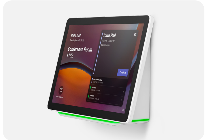
Figure 3: Room Navigator deployed as a native Microsoft Teams panel

And when using the native Cisco solution for room booking, you can significantly simplify your deployment, lower total cost of ownership and ease management efforts by leveraging a single vendor to provide platform agnostic video collaboration devices, the underlying meeting service, the room control hardware, and the associated room booking software solution.