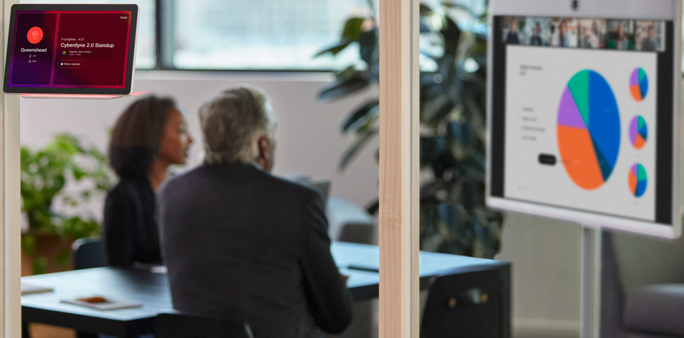
Figure 1: Cisco Room Navigator for Wall unit mounted on glass wall showing meeting room availability

Transform your workplace with simple and intelligent experiences while eliminating the friction from the employee journey. The wall-mount Cisco Room Navigator touch panel is designed to bring ease and convenience into modern workspaces by providing instant access to conference controls, smart room booking, room controls and third-party workspace applications.