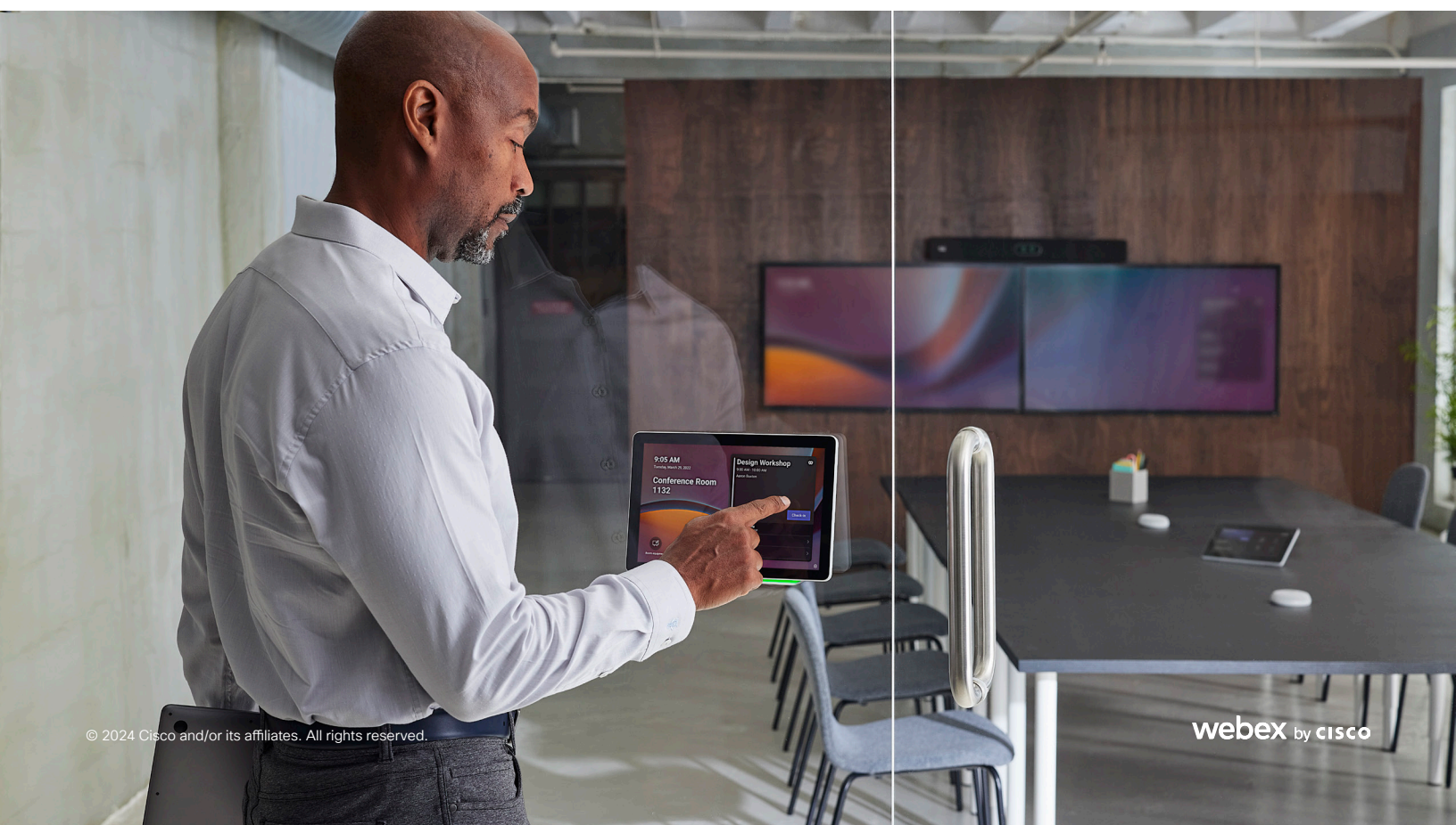
Figure 4: Room Navigator powering the Microsoft Teams panel experience