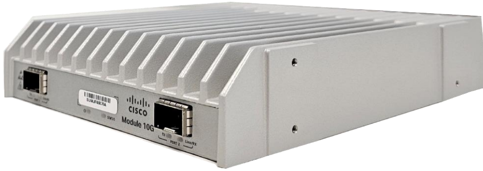
Figure 1. Cisco Provider Connectivity Assurance Sensor Module 10G model