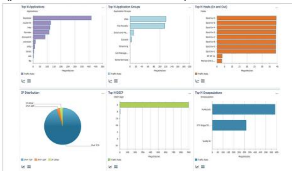
Figure 1. Cisco Prime NAM Traffic Summary View