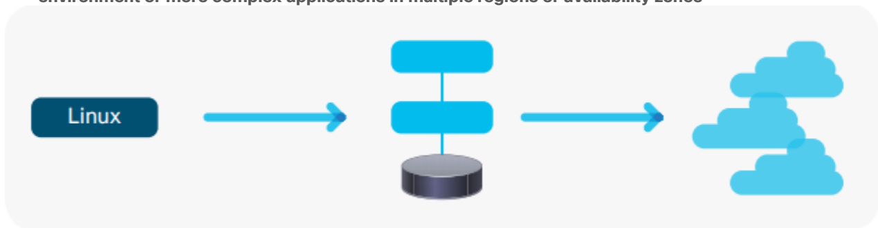
Figure 1. Deploy and manage applications starting with a simple OS image in a single environment or more complex applications in multiple regions or availability zones

With the Cisco CloudCenter solution, enterprise IT organizations can offer self-service on-demand application services, including AWS deployments starting with a simple virtual machine, or more complex enterprise or cloud-native applications (Figure 1). You can automate DevOps processes and continuous deployment or augment data center capacity. You can also use the solution as an IT-as-a Service (ITaaS) platform and broker both data center and cloud service delivery options.