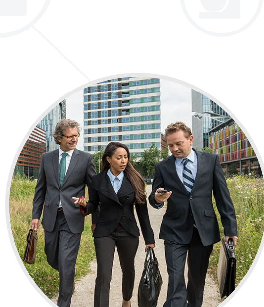
A rich partner ecosystem