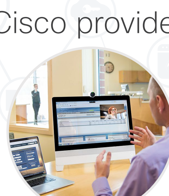
Comprehensive digital solutions for every customer