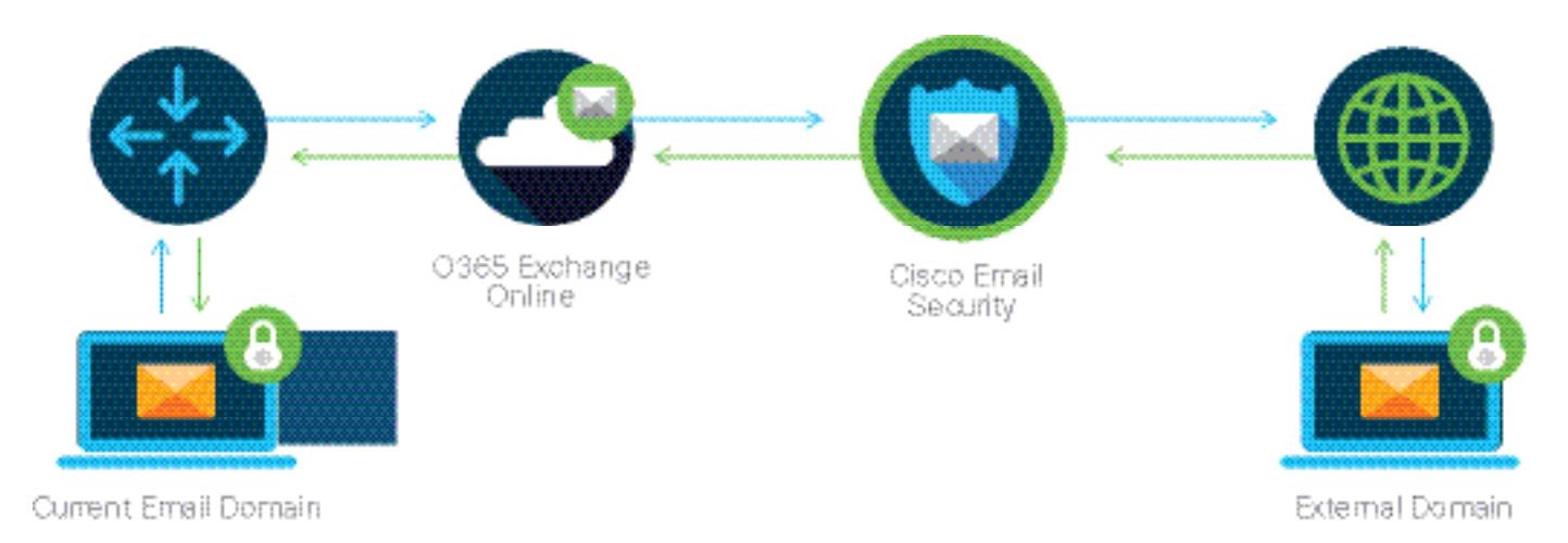
Figure 1. Cisco Email Security in the cloud for Microsoft Office 365

Cisco Email Security in the cloud integrates transparently with Microsoft Office 365 regardless of your setup: whether you have a portion of your mailboxes in the Office 365 cloud or all of them. Simply point your Mail Exchange (MX) records to the Cisco Email Security cloud platform. Configure your Smart Host settings in Office 365 to deliver outbound mail through the Cisco Email Security cloud platform, and our easy-to-use and easy-to-configure DLP and encryption features will control your outbound mail flows, hiding sensitive data from prying eyes (Figure 1).