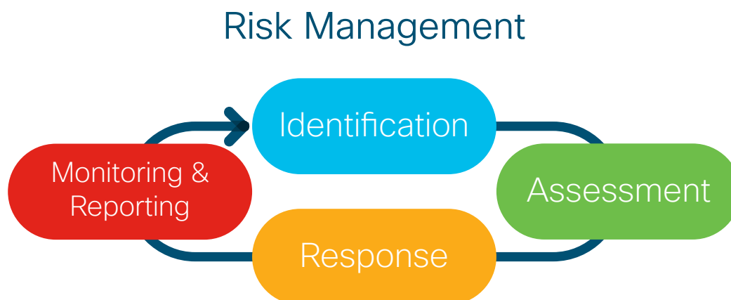
Figure 1 – Risk Management Chart