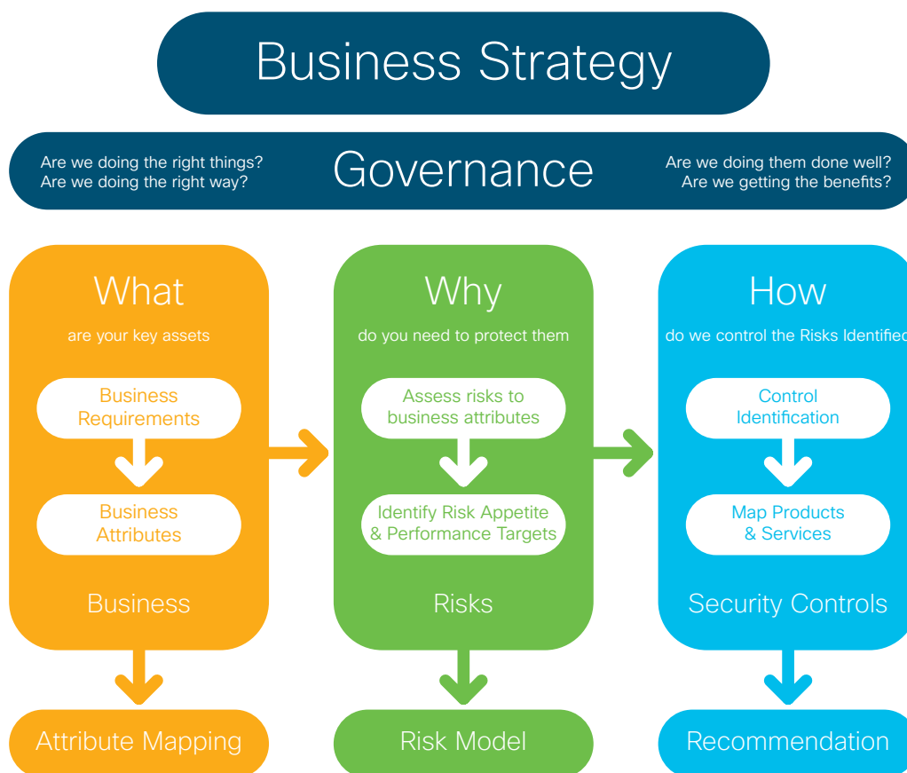
Figure 2 - The Enterprise Security Architecture Model

3. How: defines the controls that are used, these can be products, services and solutions that minimise the risks identified in the “why” phase.