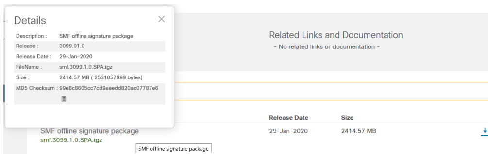
Image checksum information is available through Cisco.com Software Download Details . To find the checksum, hover the mouse pointer over the software image you have downloaded.

At the bottom you find the SHA512 checksum, if you do not see the whole checksum you can expand it by pressing the "... " at the end.