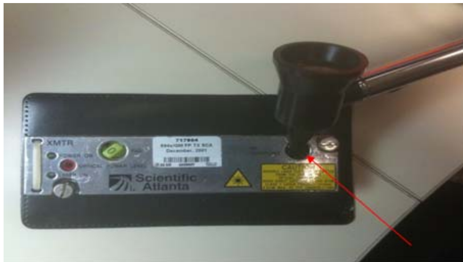
Illustration #7-6940 Tx

The following illustration shows the 6940 transmitter and the ostoscope used to inspect the capacitor. Capacitor location reference designator is C32.