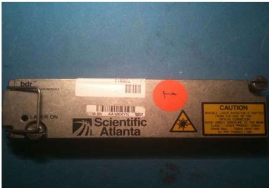
Illustration #5- 2:1 BDR Transmitter

The following illustration shows BDR 2:1 transmitters ONLY. There is no access to view the capacitor with the cover installed. If the transmitters have date code D2009 - K2009 and they are listed under the affected part number series, return the module for service. Refer to Support Telephone Numbers (on page 10).