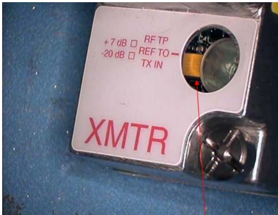
Illustration #3-Test Point opening and view of capacitor

The following illustration shows the test point opening for the GS700 transmitter and GainMaker 694X transmitter from illustration #1 and #2. Capacitor C42 (large yellow capacitor) and date code can be inspected via the test point opening using an oscilloscope at an angle.