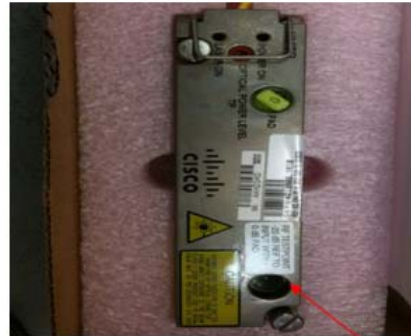
Illustration#2-Gain Maker /694X Transmitter