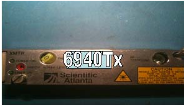
Illustration #6-6940 Tx

Note: If you are unable to determine the date code, return the module for service. Refer to Support Telephone Numbers (on page 10).