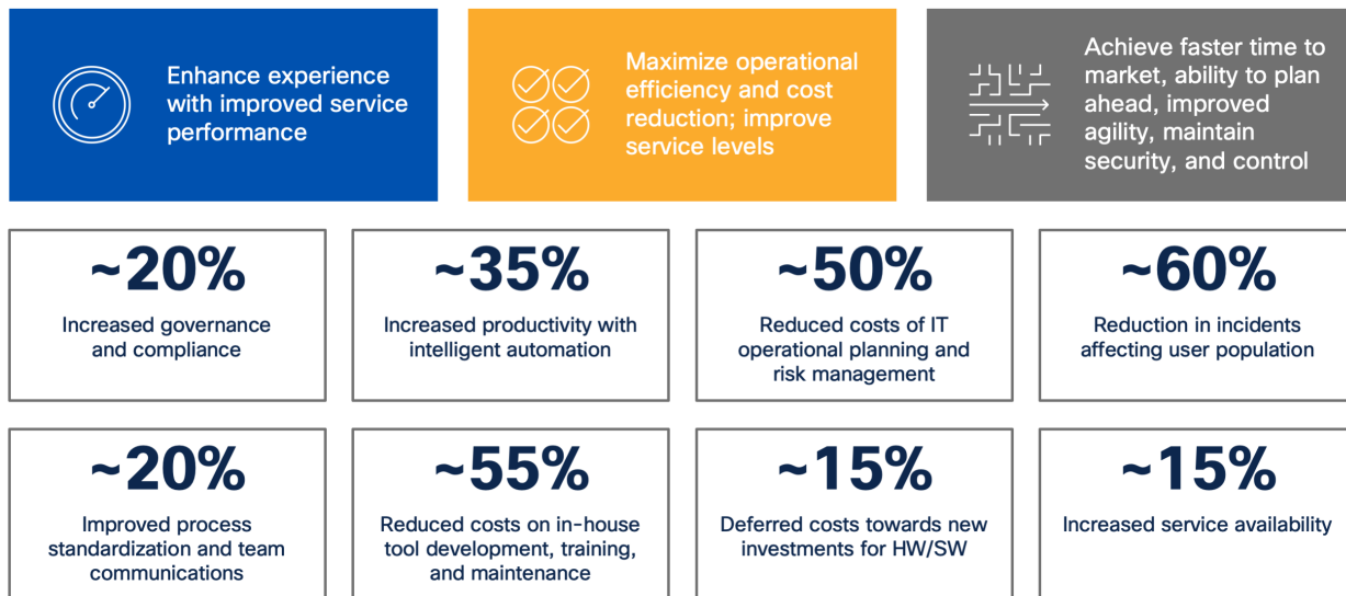
Figure 1 Service-based business outcomes from Hitachi Vantara Managed Services