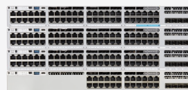
Cisco Catalyst 9300LM Series Fixed Uplinks Models