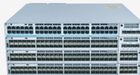
Cisco Catalyst 9300/9300X Series C9300 modular uplink models