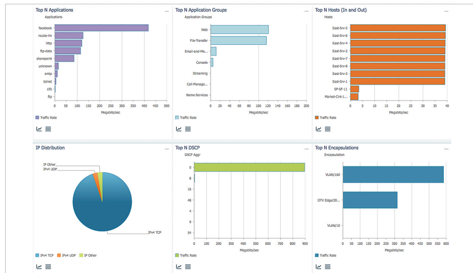
Figure 1. Cisco Prime NAM Traffic Summary View